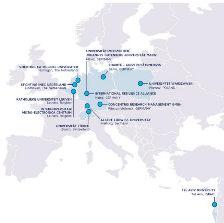
12 institutions from 6 countries (Belgium, Germany, Israel, The Netherlands, Poland and Switzerland) join forces within DynaMORE. For details, click on the map.

DynaMORE represents a joint effort of experts in computer science, neuroimaging, psychiatry, psychology, behavioural neuroscience, molecular biology, microbiology, endocrinology, engineering and management who are organised within 10 different, expertise-based work packages (WPs). The ultimate goal is to develop a mobile health (mHealth) device that assists and guides people in a personalized manner through adverse life circumstance in order to prevent stress-induced clinical outcomes, such as depression, anxiety, or other mental disorders.