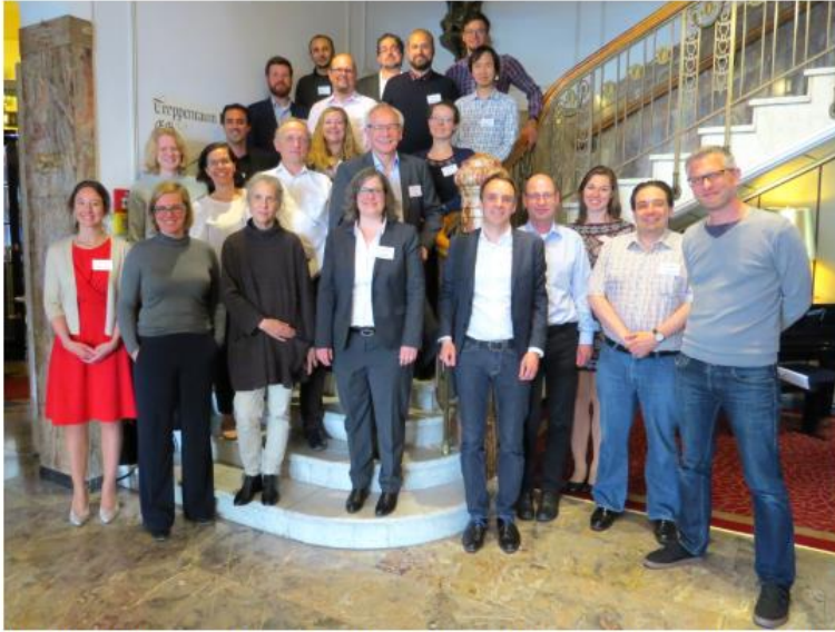
The DynaMORE consortium at the kick-off Meeting in Wiesbaden, Germany, on 25 April 2018 (click on image to see a few more pictures from the meeting).

DynaMORE represents a joint effort of experts in computer science, neuroimaging, psychiatry, psychology, behavioural neuroscience, molecular biology, microbiology, endocrinology, engineering and management who are organised within 10 different, expertise-based work packages (WPs). The ultimate goal is to develop a mobile health (mHealth) device that assists and guides people in a personalized manner through adverse life circumstance in order to prevent stress-induced clinical outcomes, such as depression, anxiety, or other mental disorders.